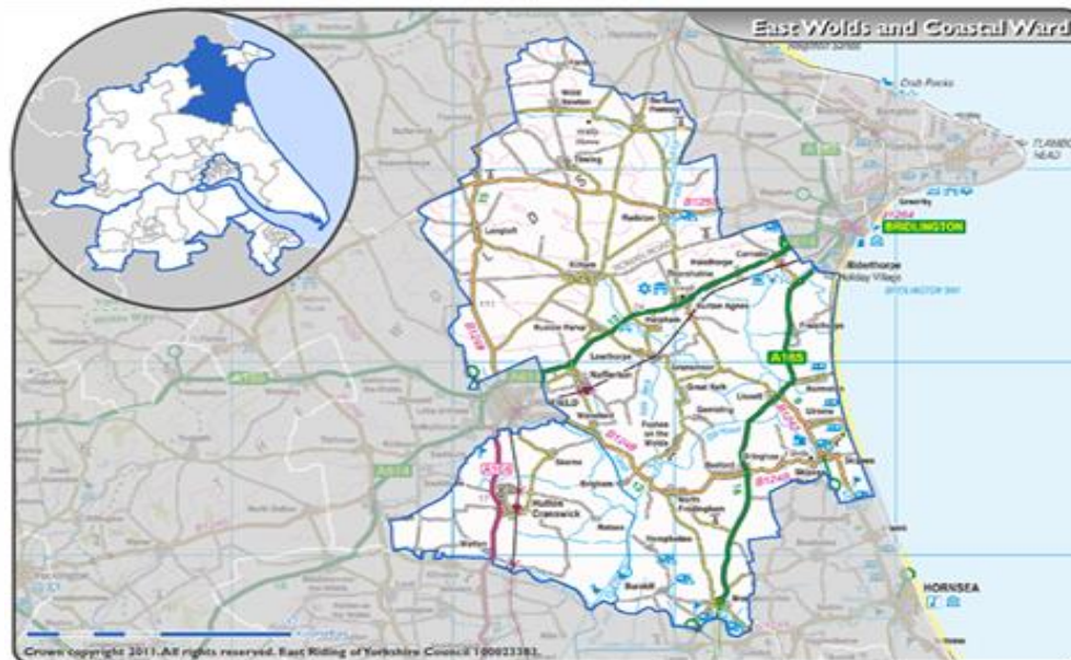
AREA COVERED BY EAST WOLDS & COASTAL TEAM

Local agencies working in this area will not tolerate anyone committing crime, causing anti-social behaviour or being responsible for environmental crime (littering, graffiti, etc) in your neighbourhood and neither should you!